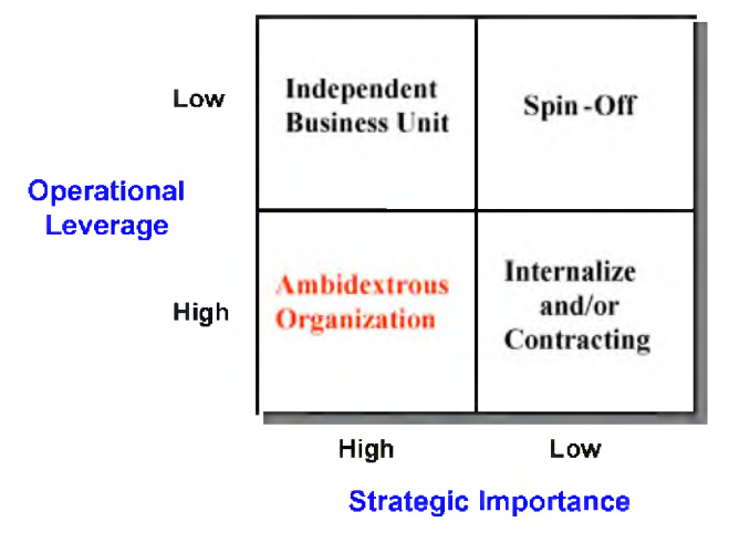
Fig. 3. When should ambidexterity be considered?

If a product has low strategic importance but offers operational leverage (e.g., the use of channels of distribution) it can be either internalized or contracted out. For example, the repair of most personal computers, a low margin item, is handled by contractors rather than the manufacturer. When a business is strategically important but cannot benefit